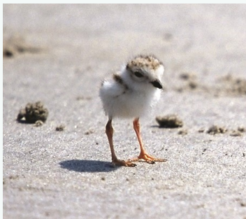
Outdoor cats can kill rare species such as this piping plover chick.