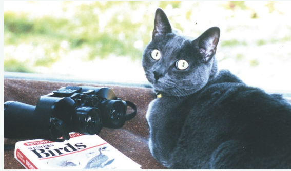
An indoor cat is a safe and happy cat.