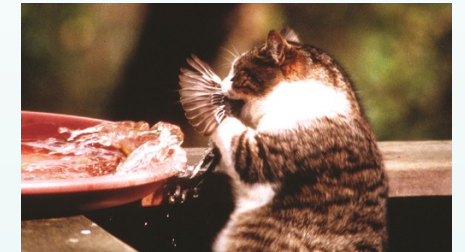
Cat killing a yellow-rumped warbler at a bird bath.